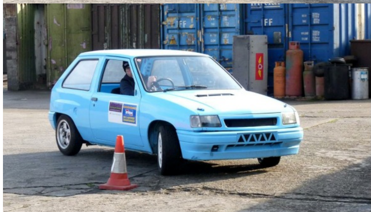
Understeer (FWD) v Oversteer (RWD)